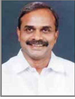
Dr.Y.S. RAJASEKHARA REDDY