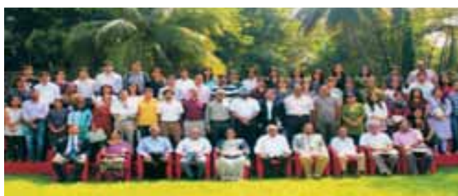
Group photograph with students