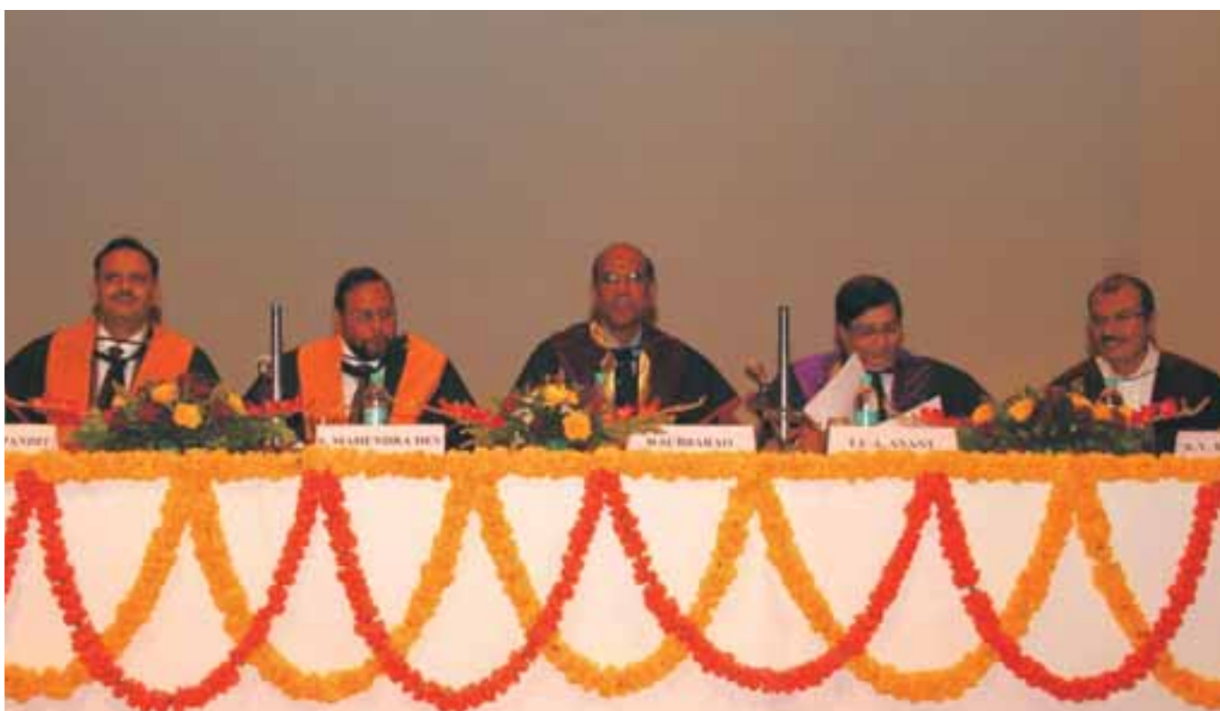
Eighth Convocation: Group photograph of the faculty