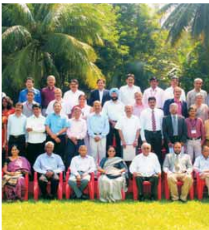
Group photograph with faculty and staff