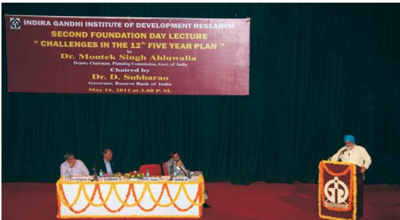
Second Foundation Day Lecture by Dr. Montek Singh Ahluwalia, Deputy Chairman Planning Commission, Government of India