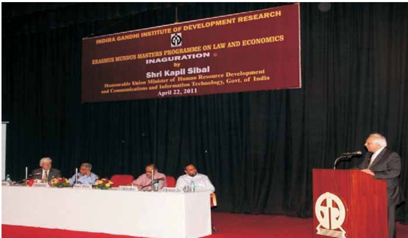
Inauguration of Erasmus Mundus Masters Programme on Law and Economics by Shri Kapil Sibal, Honourable Union Minister of Human Resource Development and Communication and Information Technology, Government of India