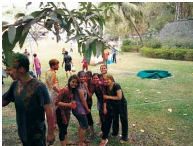
Holi Celebration on campus