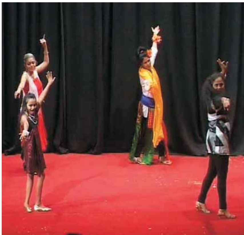
Staff Group Dance