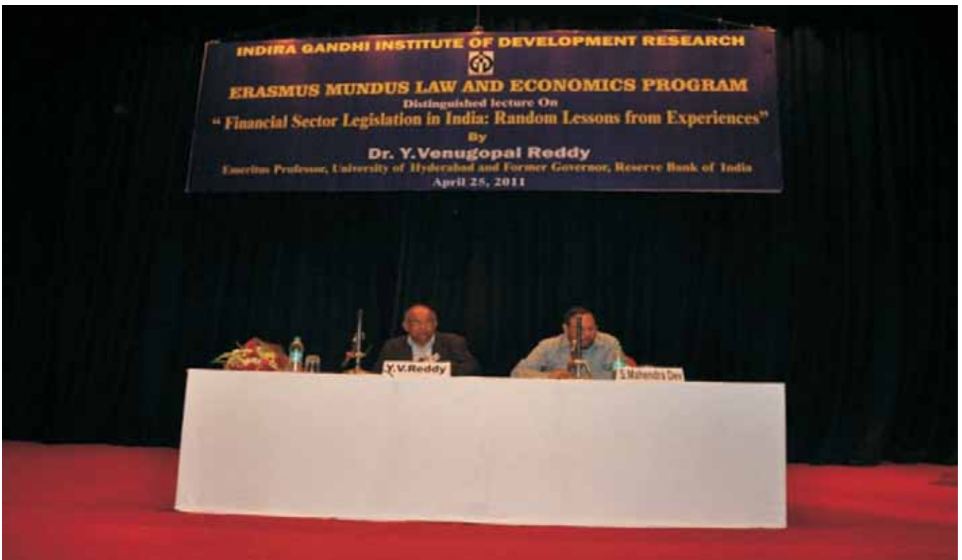
Distinguished Lecture by Dr. Y. Venugopal Reddy, Emeritus Professor, University of Hyderabad and Former Governor, RBI held (Erasmus Mundus Law and Economics Program)