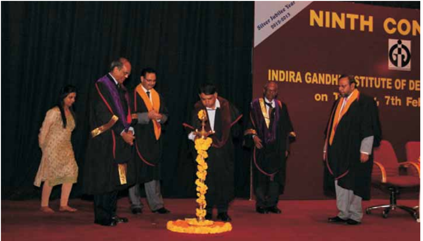
IGDR – Ninth Convocation – Lighting of the lamp