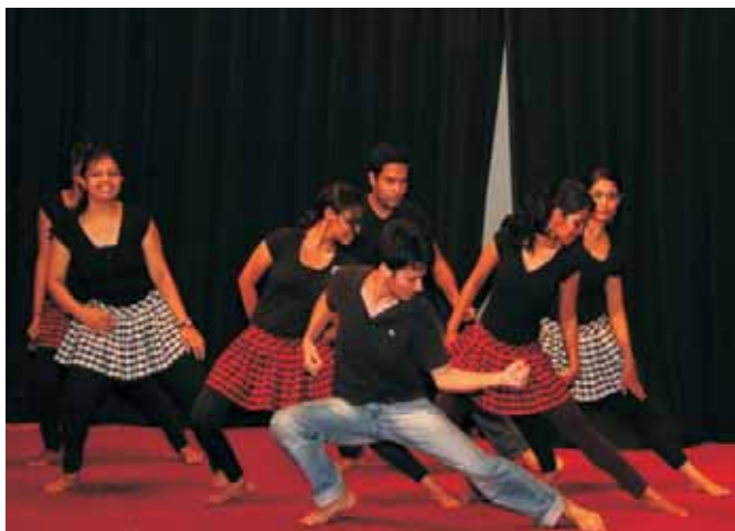
Group Dance Performance - Students