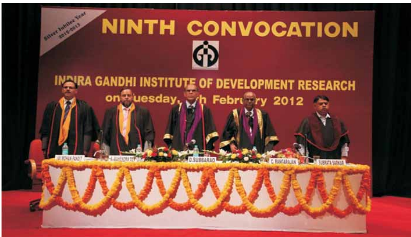
Singing of national anthem