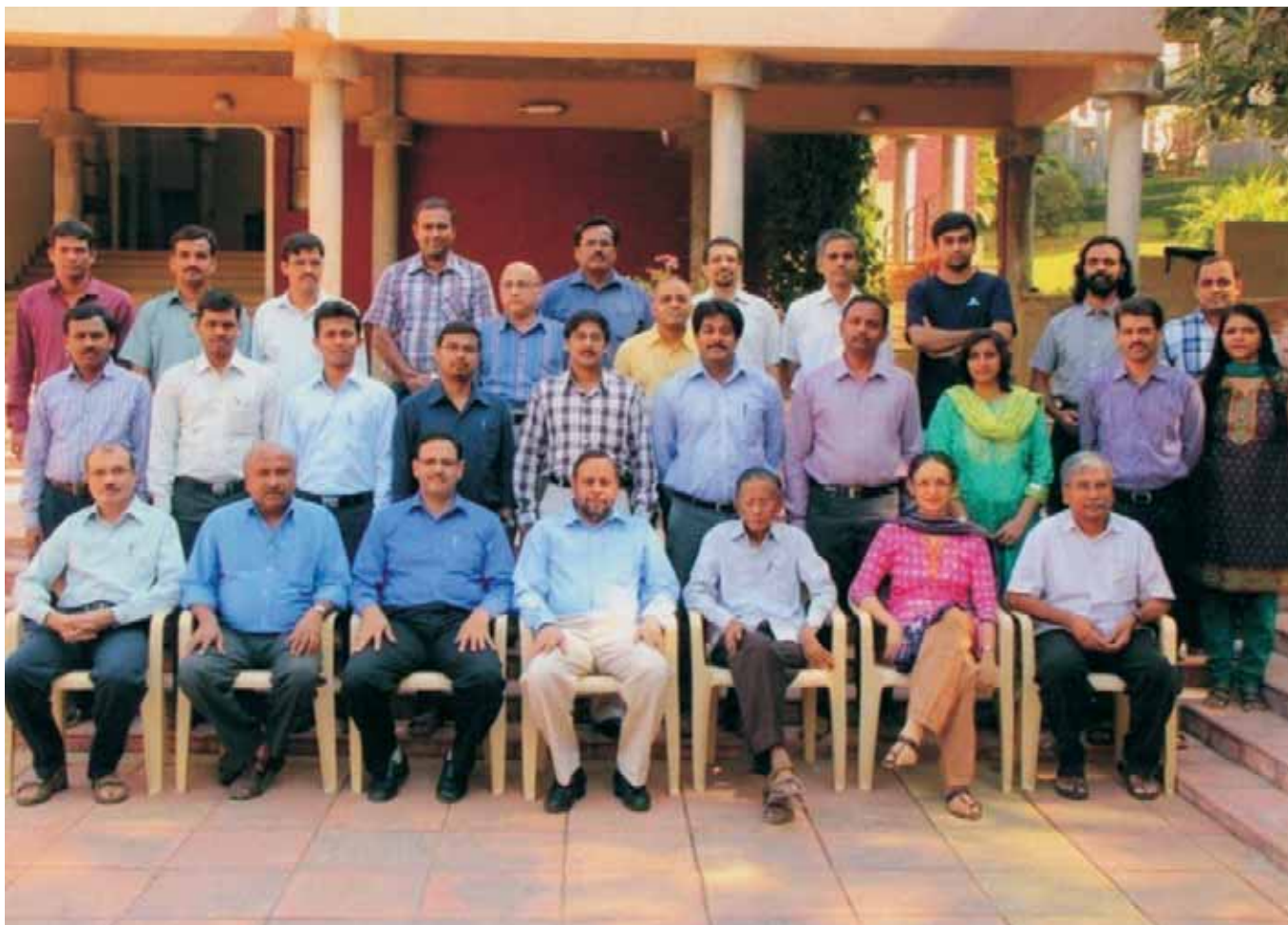
IGIDR organized an intensive refresher course for College/University Faculty on Advances in Economics as part of its nationwide capacity building activities – Group photograph