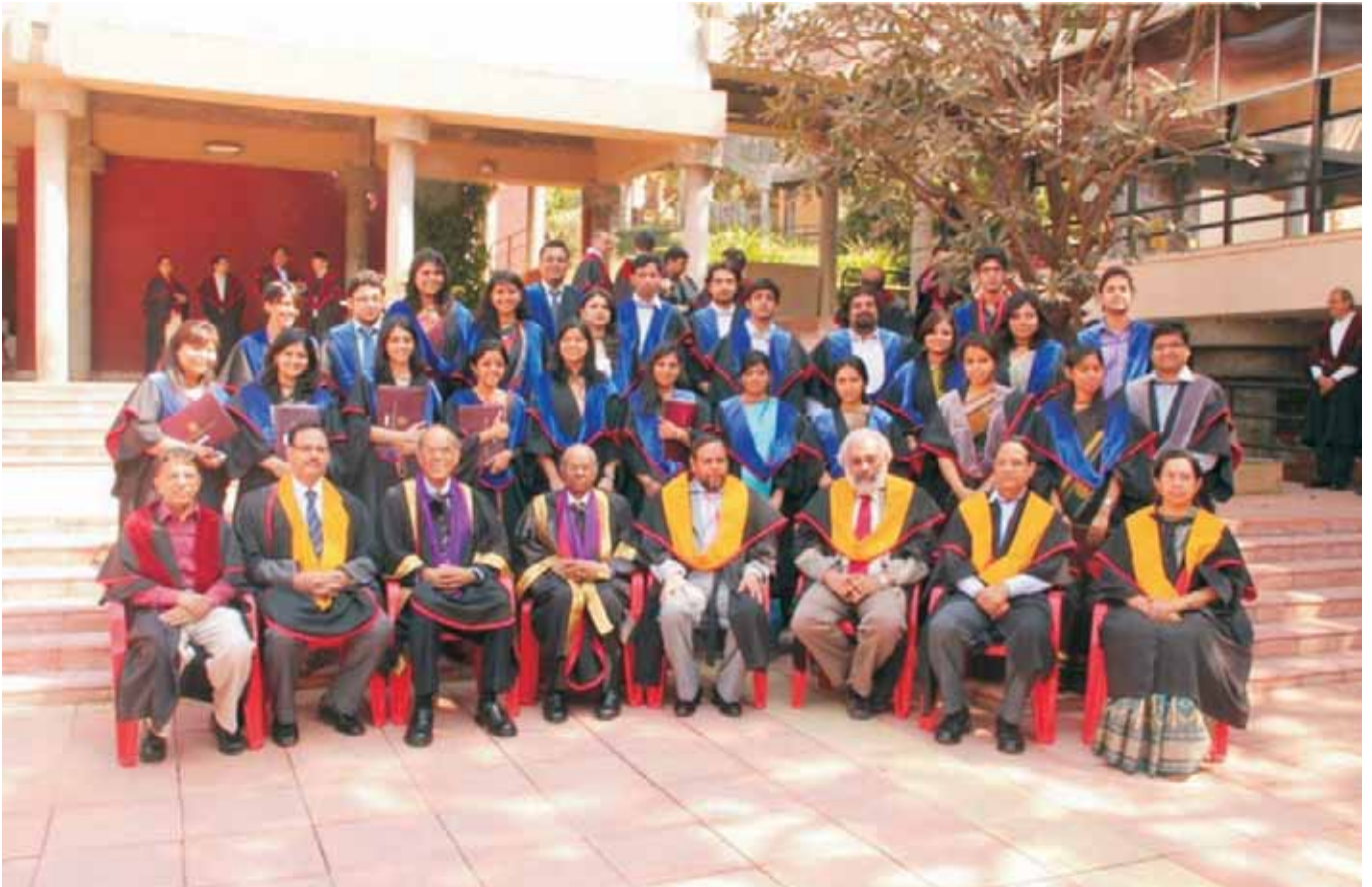
Group photograph of students