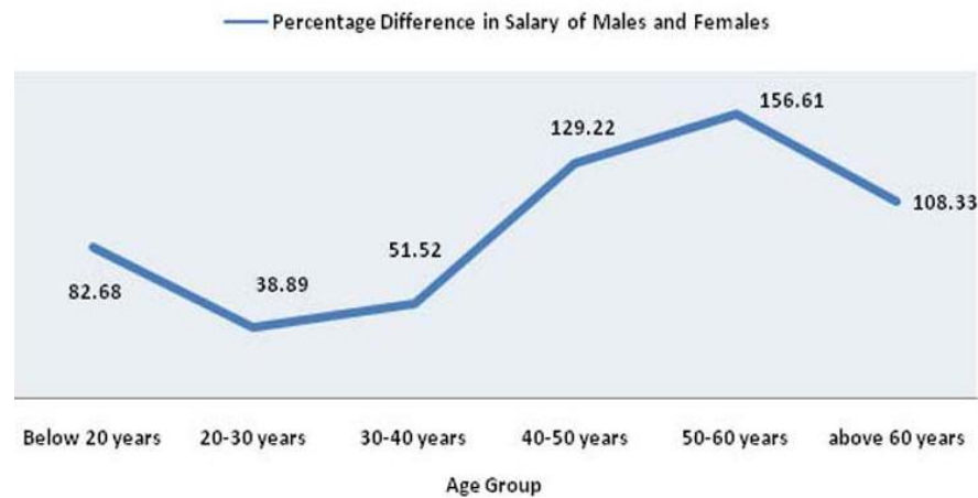
Figure 1. Gender pay gap in India with respect to the age of employees

employed informally, and among those that are employed in the formal sector, females constitute only 19%–20%.