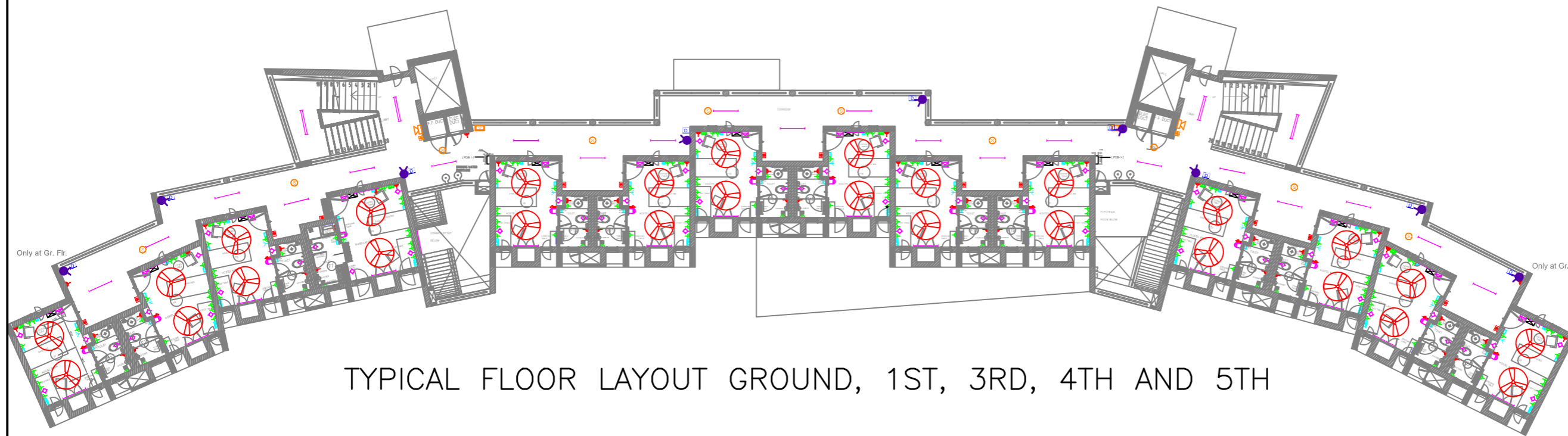
TYPICAL FLOOR LAYOUT GROUND, 1ST, 3RD, 4TH AND 5TH